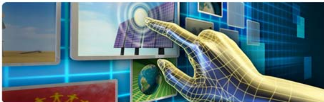
General Image for E-Services

The Research Electronic Submission System